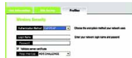
Figure 6-22: EAP-PEAP Authentication